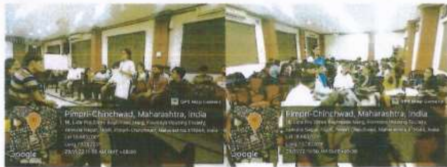
Different activities conducted for the students