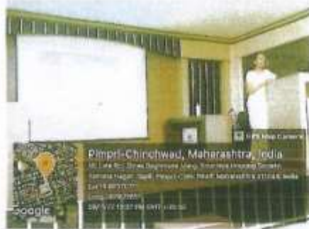
Interaction of the resource person with the students