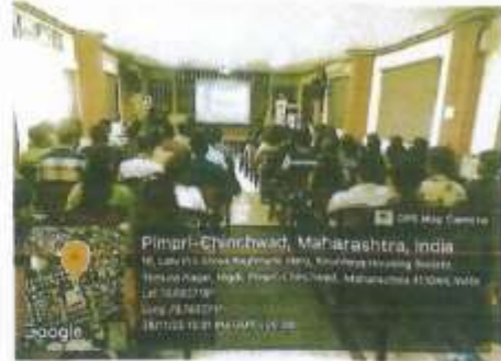
Participants of the session