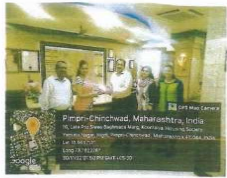
Felicitation of the resource person by Principal Sir