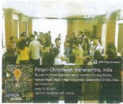
Different activities conducted for the students (Benefits of Team Work)